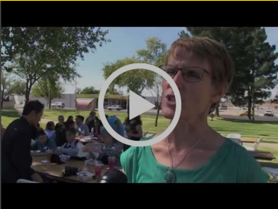
Video on the day from KRWG-FM: Local Group Helps Bring Different Communities Together Through Civic Action